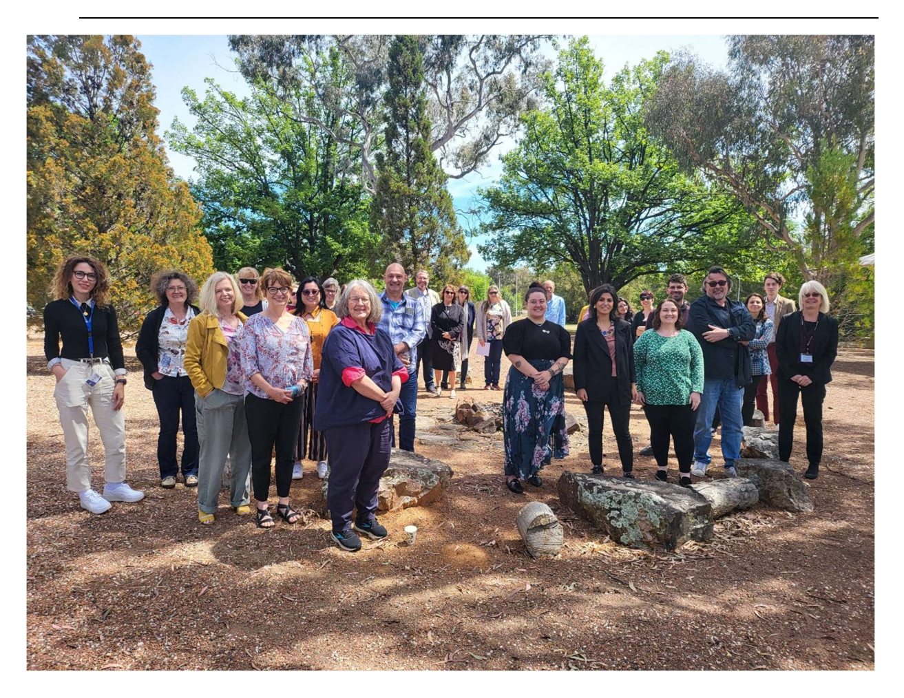
Research School participants in a yarning circle at Charles Sturt University, in Canberra.

The aim of the ASCILITE Spring into Excellence Research School was to: