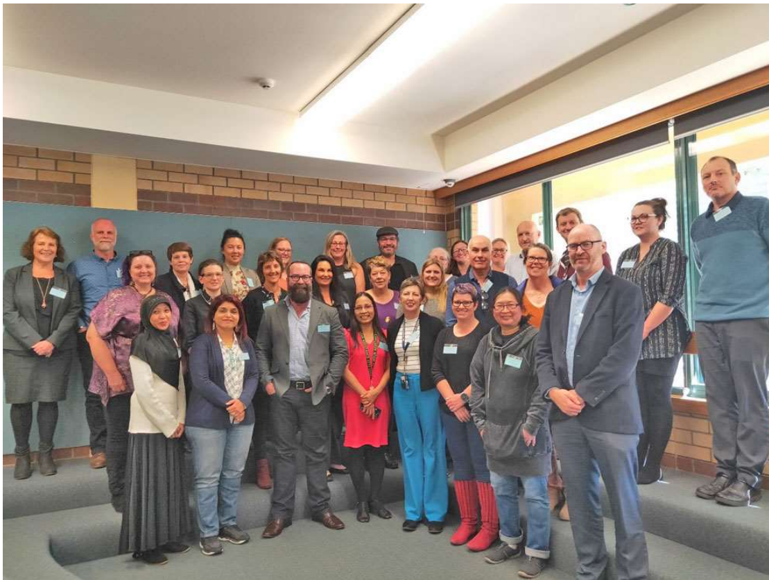
Above: Research School participants and facilitators 2 September 2019