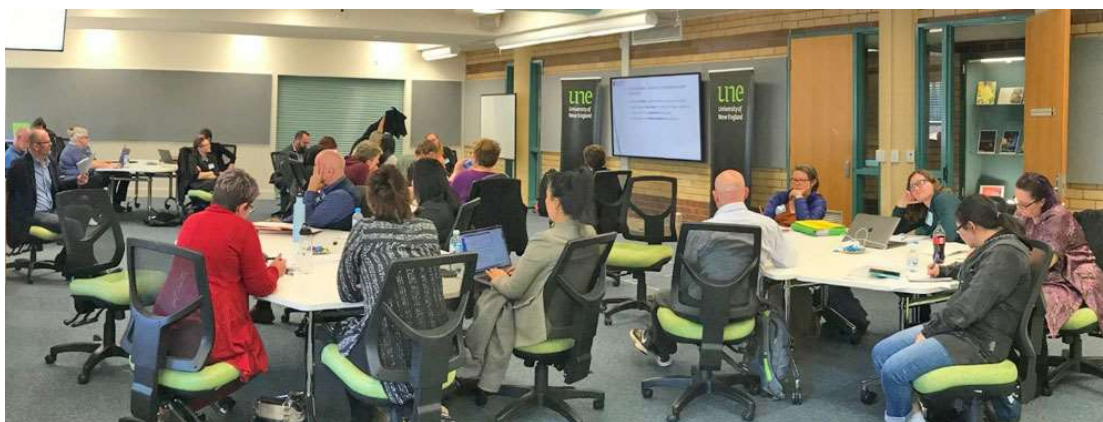
Above: Group discussions on day one of the 2019 Research School

Throughout the Research School, both participants and facilitators had the opportunity to network over lunch, during breaks and at arranged dinners on both evenings.