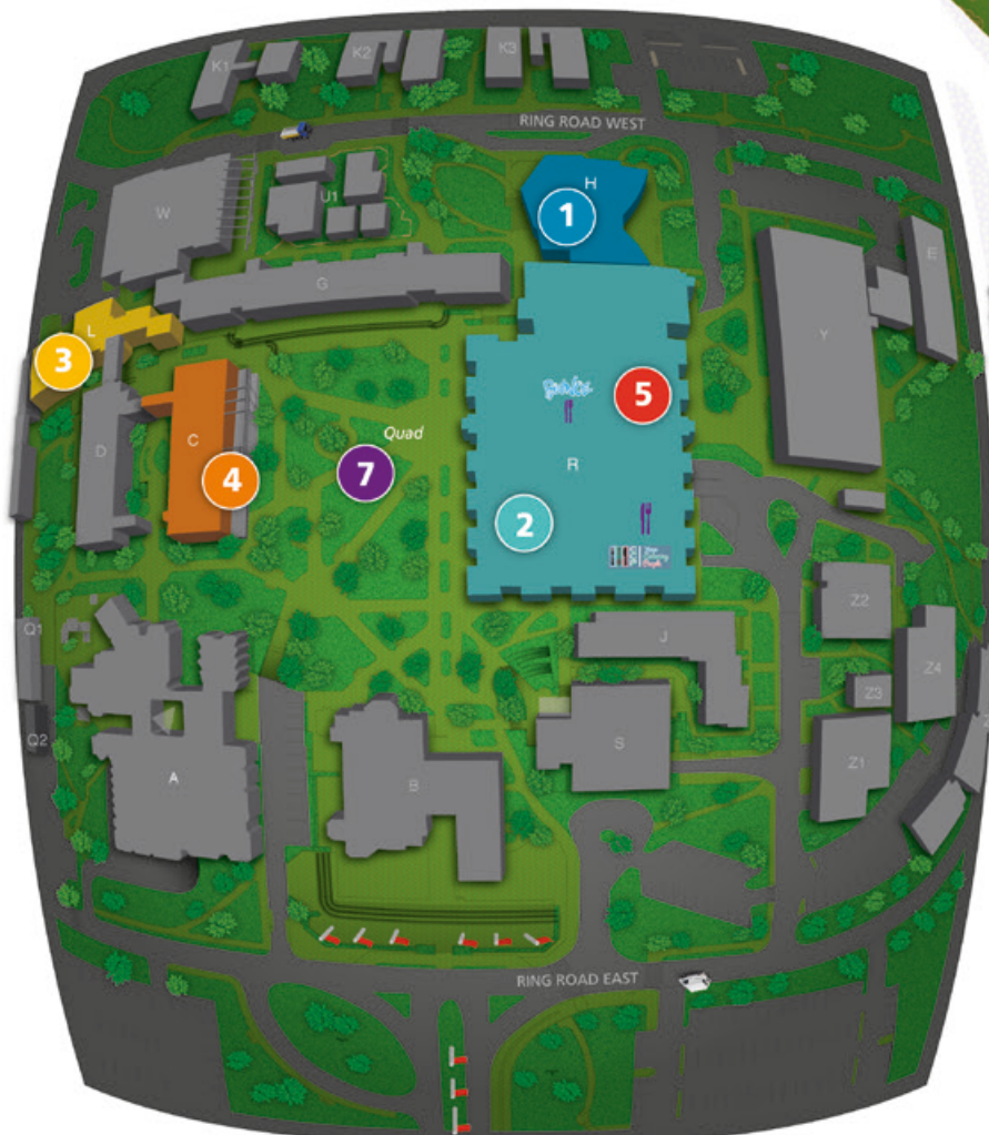
6 Wisteria Pergola Flowering Peach Green