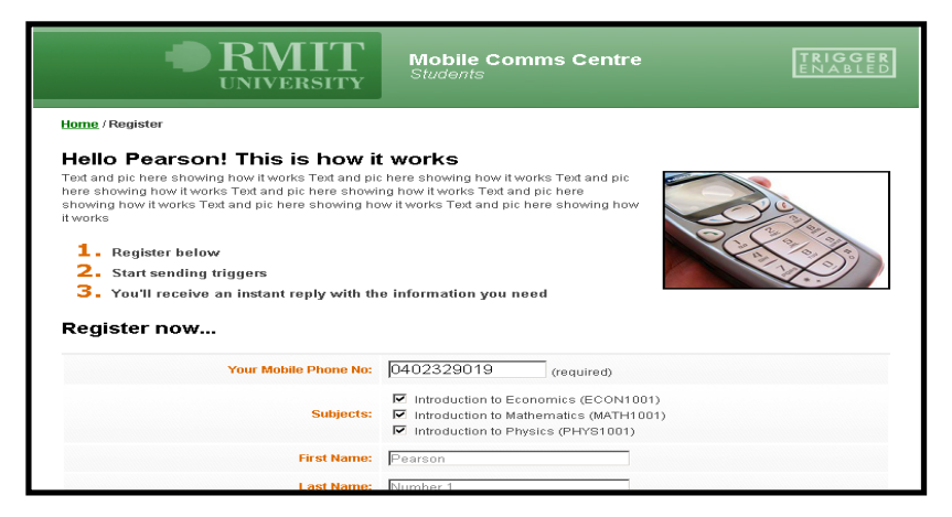
Figure 3: Student registration web site

Student responses to the survey instrument indicated that 98% found the web interface that facilitated registration into the SMS system easy to use. The language used to engage and instruct the students and the layout of the web interface were obviously effective for the student cohort participating in the pilot and responding to the survey. Discussions and research that provide clarity and guidelines to assist in the creation of SMS messages for business purposes based communication systems is just commencing. "Trigger Control Cards" were provided to students courtesy of Pearson Education Australia. These wallet-sized paper cards contained samples of responses, that enabled the students to have an abbreviated ready access lexicon to the online registration address and reminders of the possible text triggers at any time. This site is displayed in Figure 3.