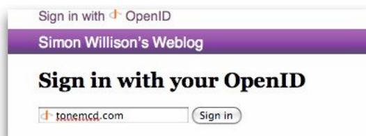
Figure 1: Authenticating with OpenID at a site

Using OpenID in action is very simple. Instead of entering a username/password combination, I use an OpenID;