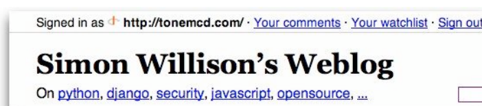
Figure 3: I am redirected back to the original site, and can now login to other OpenID-enabled sites.