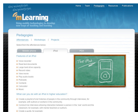
Figure 1: Web pages from the project website