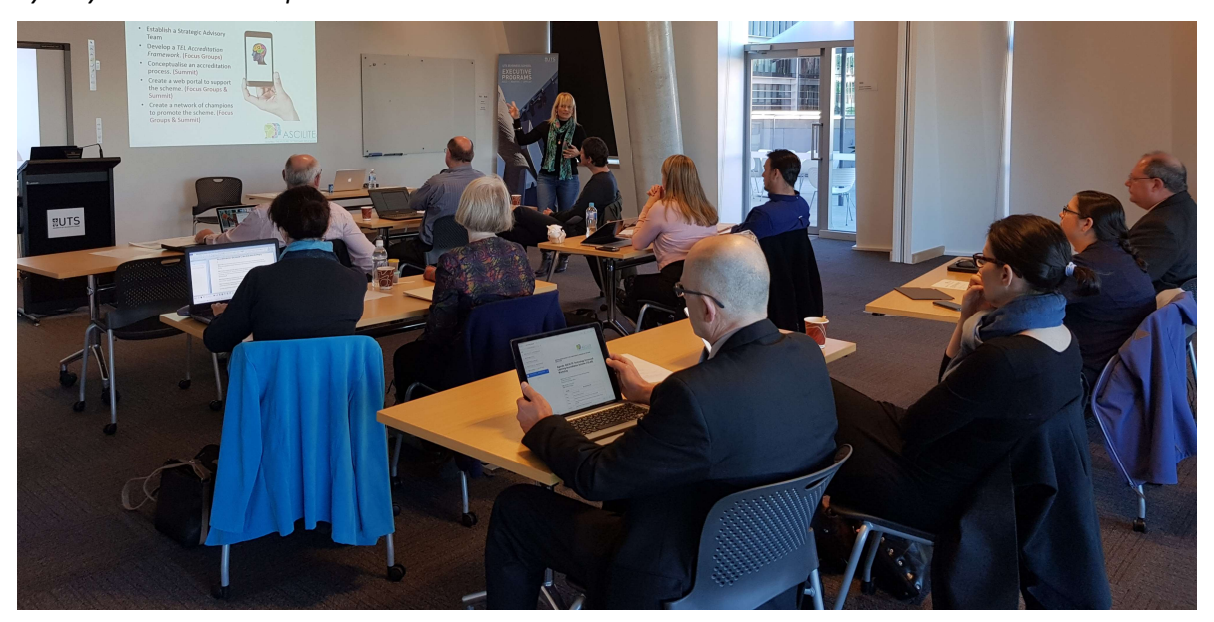
Adelaide TELAS workshop