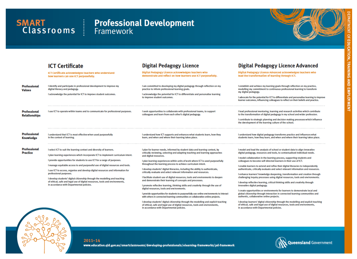
Figure 1: SMART Classrooms Professional Development Framework

Education Queensland (a state teacher employing authority) developed a SMART Classrooms Professional Development Framework (SCPDF) (Department of Education and Training, 2012a). This framework provided a mechanism for teachers to self-assess their teaching attitudes and practices with regard to digital technology use. Teachers prepared a portfolio for this three level accreditation process. For each level, the teacher was asked to discuss and provide evidence of their professional values, relationships, knowledge and practice in line with a series of predetermined indicators. This framework is shown in Figure 1.